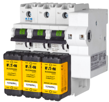
30 and 60 amp CCP2 Shown with right through-the-side rotary