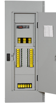
Shown with 18 branch positions