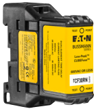
Fits 1 to 30 amp fuses