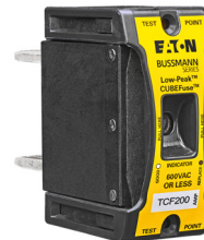
110 to 225 amps