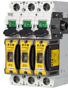
200 amp CCP2 Shown with right through-the-side rotary