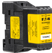
Fits 1 to 60 amp fuses