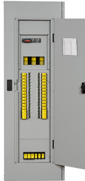
Shown with 30 branch positions