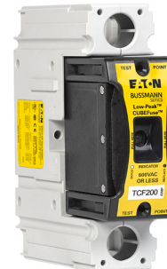
Fits 110 to 225 amp fuses