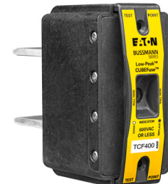
250 to 400 amps