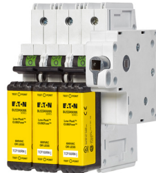
100 amp CCP2 Shown with right through-the-front rotary