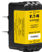
35 to 60 amps