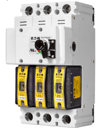
400 amp CCP2 Shown with through-the-front rotary