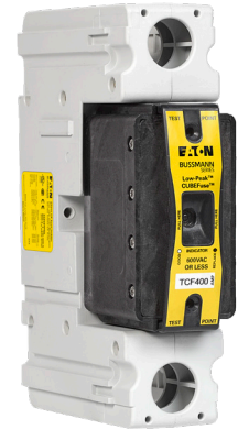
Fits 110 to 400 amp fuses