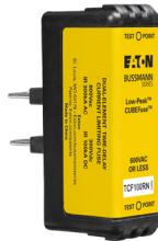
70 to 100 amps