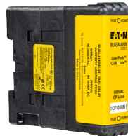
Fits 1 to 100 amp fuses